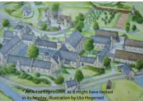
* An Artist Impression, as it might have looked in its heyday, illustration by Uto Hogerzeil