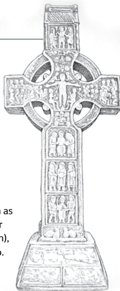
West Face (Illustration)