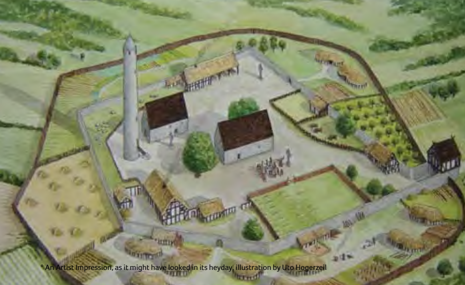
* An Artist Impression, as it might have looked in its heyday, illustration by Uto Hogerzell