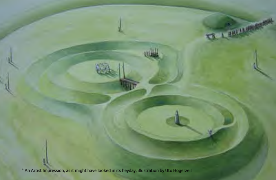
* An Artist Impression, as it might have looked in its heyday, illustration by Uto Hogerzeil

Rath na Rí (The Fort of the Kings), Teach Cormaic (Cormac's House), Rath Gráinne (The Fort of Gráinne), Rath na Seanadh (The Rath of the Synods) and Claoín Fhearta (The Sloping Trenches).