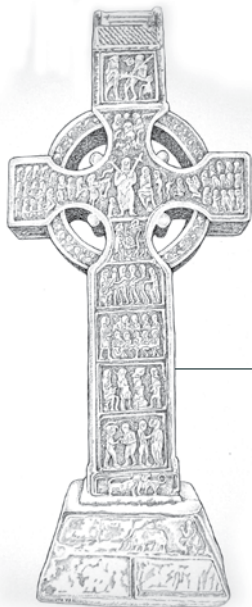
East Face (Illustration)