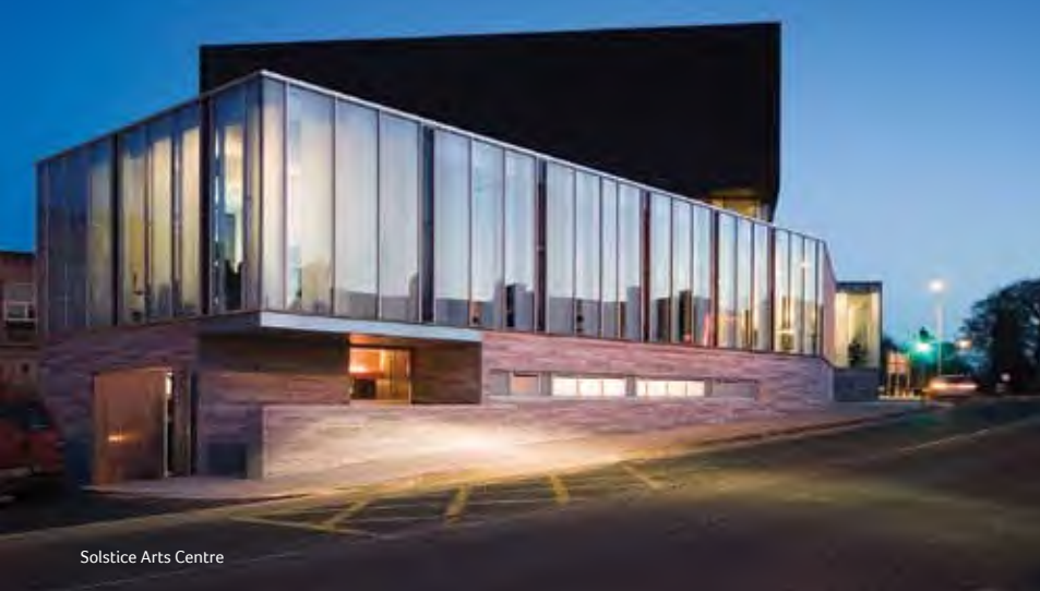
Solstice Arts Centre

could safely hoist. The Beaufort Scale, as it came to be known, was adopted by the Royal Navy in 1838 when it became mandatory for all ship's log entries. The 13-point scale ranges from 0 (calm) to 12 (hurricane); with this scale also came descriptions of the state of the sea. From this standard, sailors were able to predict how ships would react in certain wind speeds.